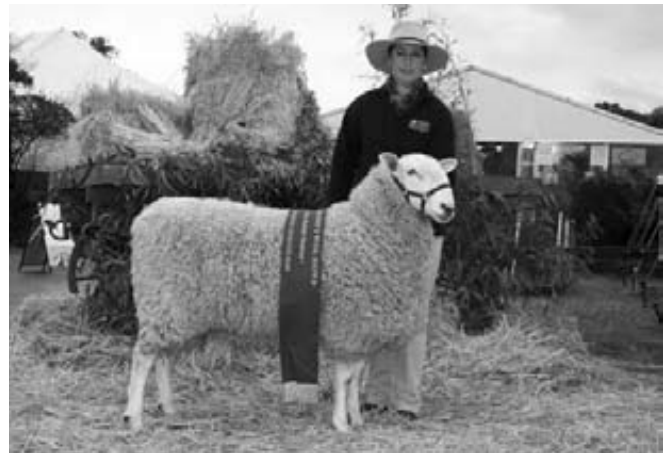
Retallack Pocket Watch, Champion Border Leicester ram for the second consecutive year at the 2008 ASBA Show, Bendigo and Supreme Long Wool Exhibit 2008 Canberra Royal