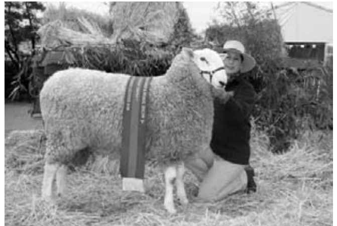
Retallack 574.07, Junior Champion and overall Reserve Champion Ram at the 2008 ASBA Show in Bendigo and Champion Ram at the 2008 Cooma Show.